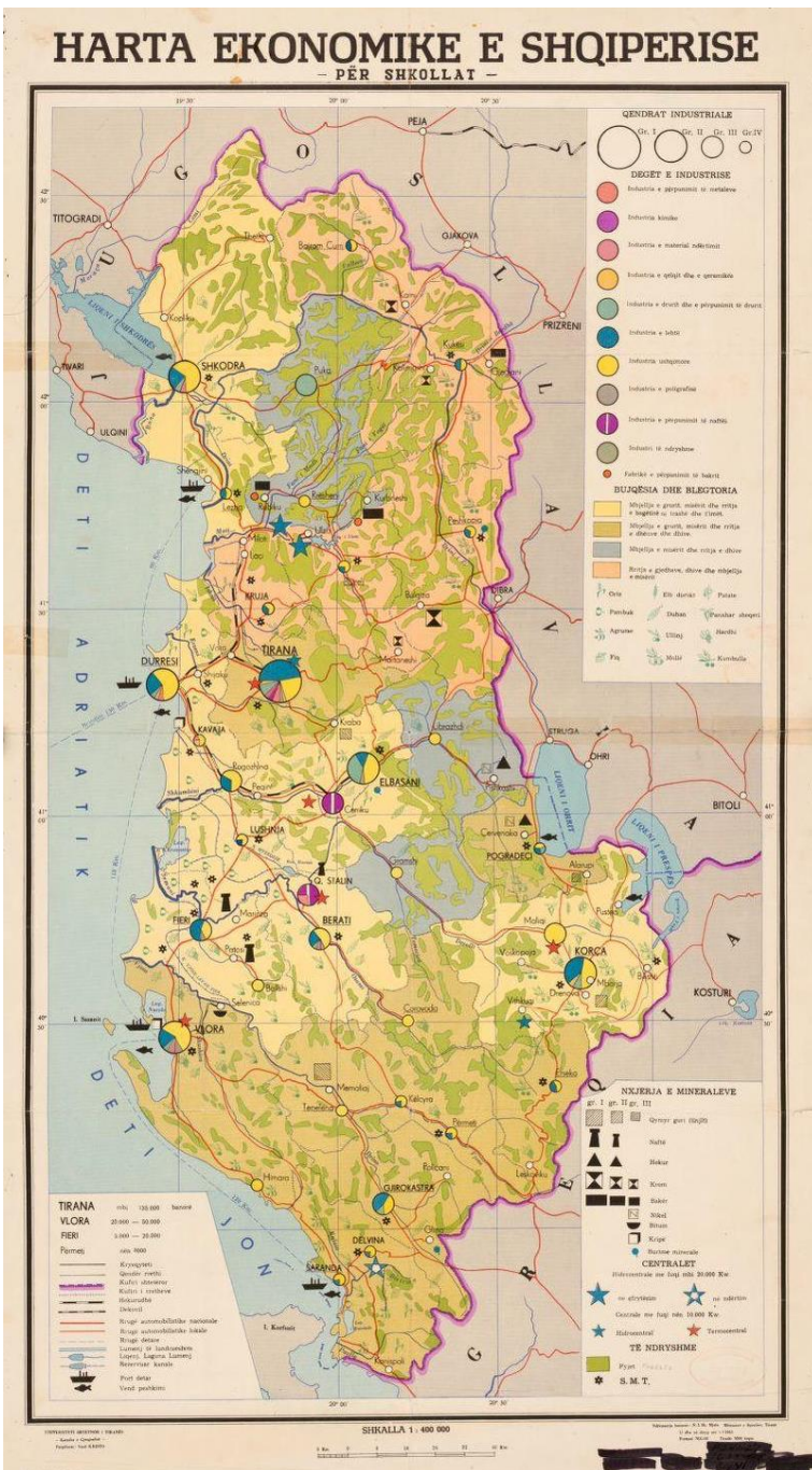
Map 3.1. Albania's economic map: for schools. Compiled in 1963 by prof.dr. Vasil Kristo.