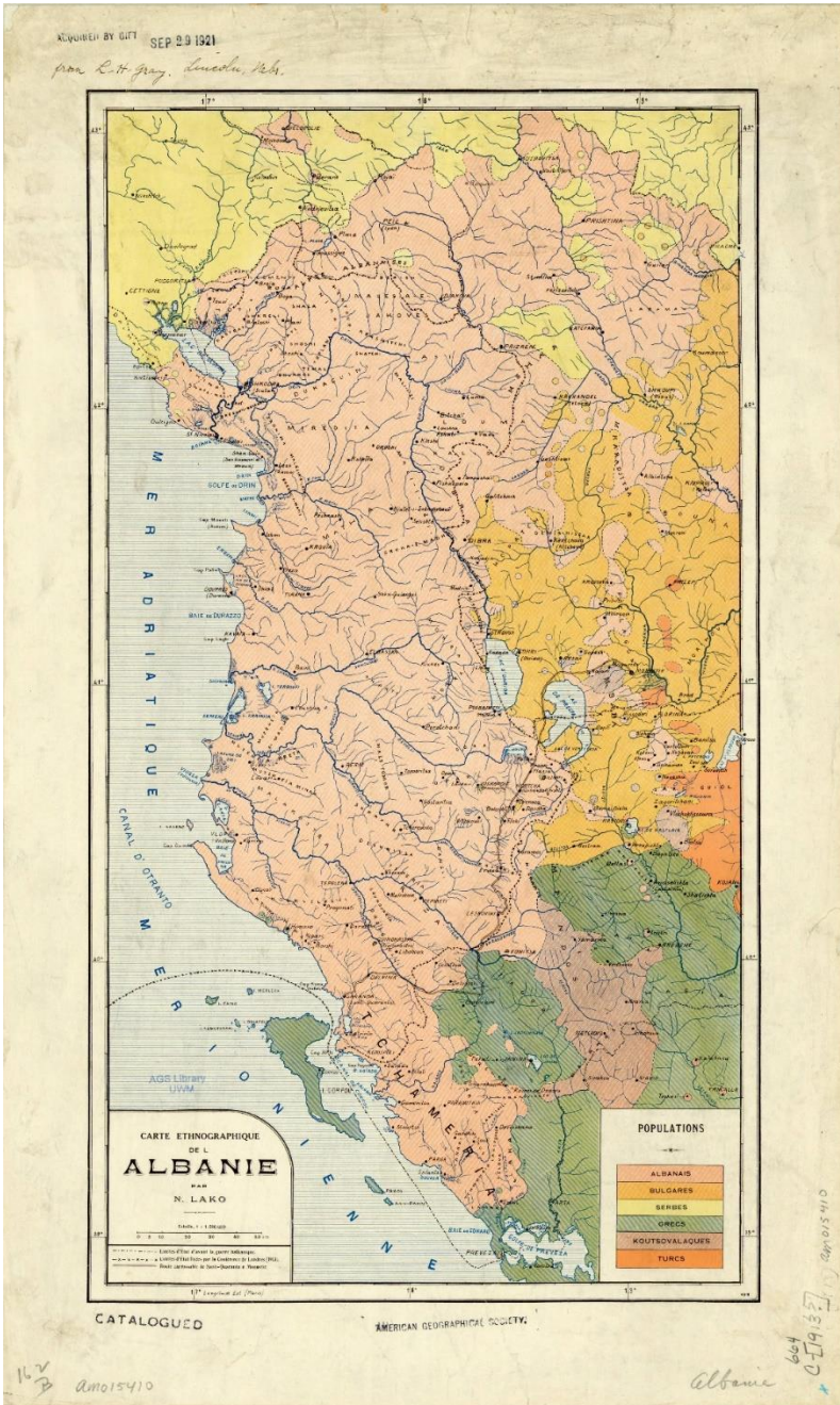
Map 2. N. Lako. "Ethnographic Map of Albania" was published in 1913 in Paris.